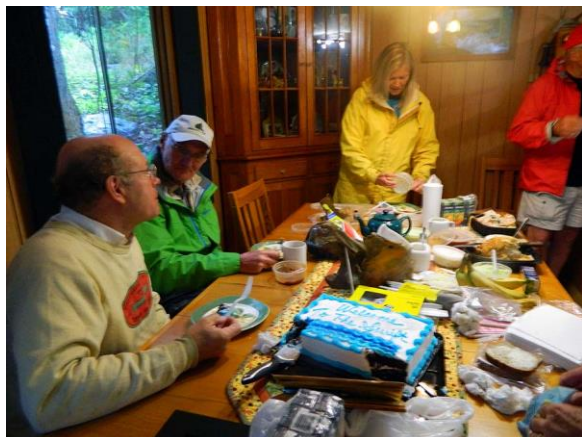
LUNCH AT PAGE'S COTTAGE