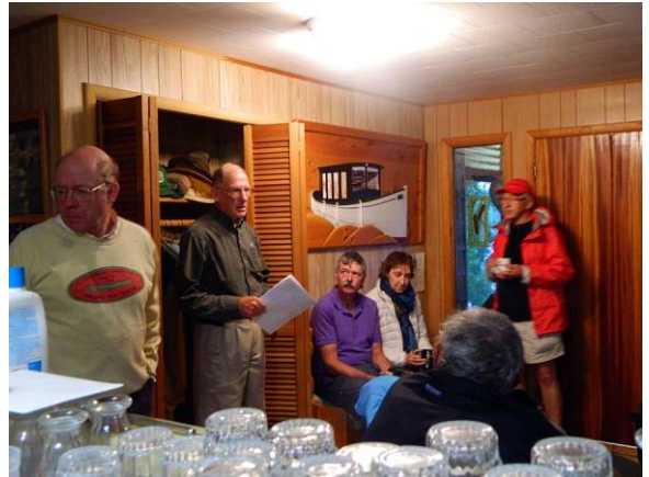
A LITTLE HISTORY