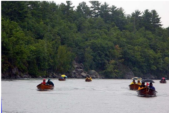
THROUGH THE CUT